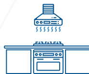
Westinghouse 900mm Wide Stainless Steel Appliances